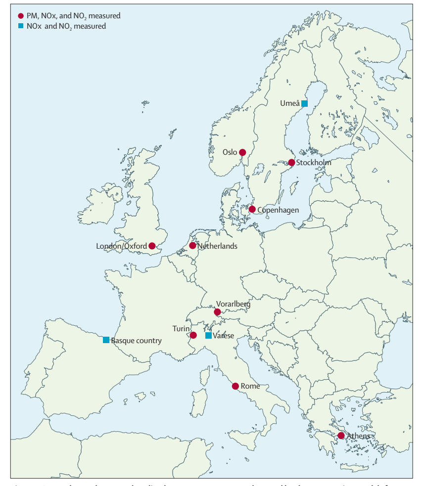
Figure 1: Areas where cohort members lived, measurements were taken, and land-use regression models for prediction of air pollution were developed

exposure to air pollution on human health in Europewhich included 36 European areas in which air pollution was measured, land-use regression models were developed, and cohort studies were located. The present study included 17 cohort studies, located in 12 areas, from which information about incident lung cancer cases and the most important potential confounders could be obtained, and where the resources needed for participation were available. These cohorts were in Sweden (European Prospective Investigation into Cancer and Nutrition [EPIC]-Umeå, Swedish National Study on Aging and Care in Kungsholmen [SNAC-K], Stockholm Screening Across the Lifespan Twin study and TwinGene [SALT], Stockholm 60 years old and IMPROVE study [Sixty], Stockholm Diabetes Prevention Program [SDPP]), Norway (Oslo Health Study [HUBRO]), Denmark (Diet, Cancer and Health study [DCH]), the Netherlands (EPIC-Monitoring Project on Risk Factors and Chronic Diseases in the Netherlands [MORGEN], EPIC-PROSPECT), the UK (EPIC-Oxford), Austria (Vorarlberg Health Monitoring and